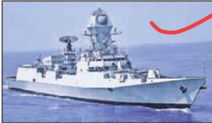
Guided-missile destroyer Surat