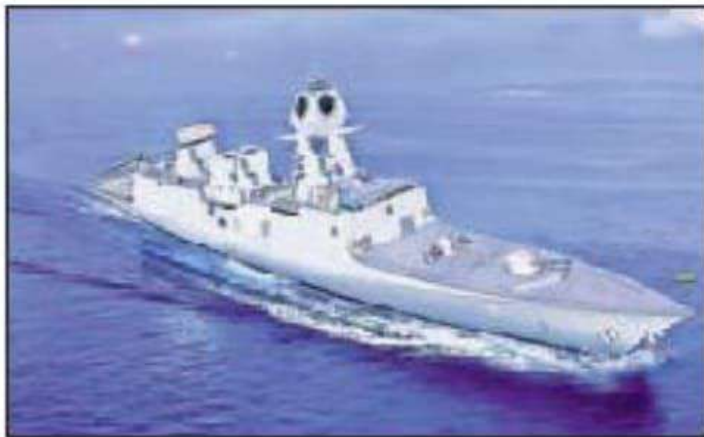
Stealth frigate Nilgiri