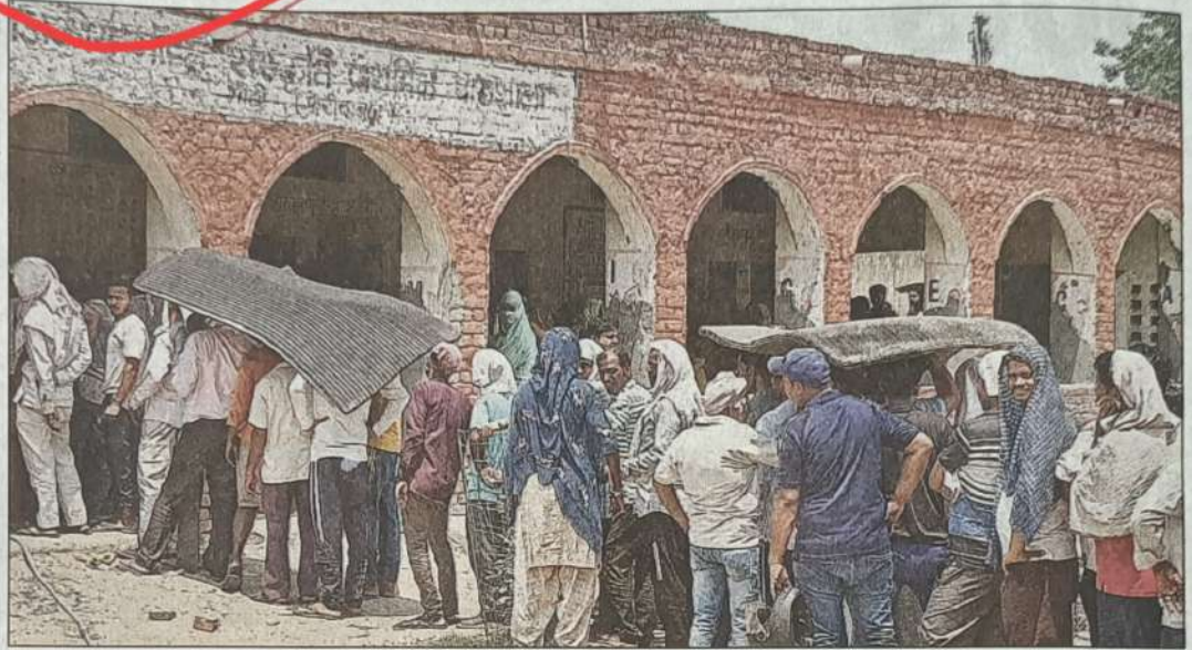
The striped mattresses were a striking sight at the queues outside the polling centre in Faridabad's Gaunchhi

between 64 and 26%. According to the weather analysts, the city saw moisture laden easterly winds towards evening and dry and warm westerly during afternoon. Moisture kept the outdoor hot and humid causing excessive sweating. Meanwhile, several areas also saw warm night conditions, which occurs when maximum temperature is above 40 degrees Celsius and the minimum is at least 4.5 notches above normal.