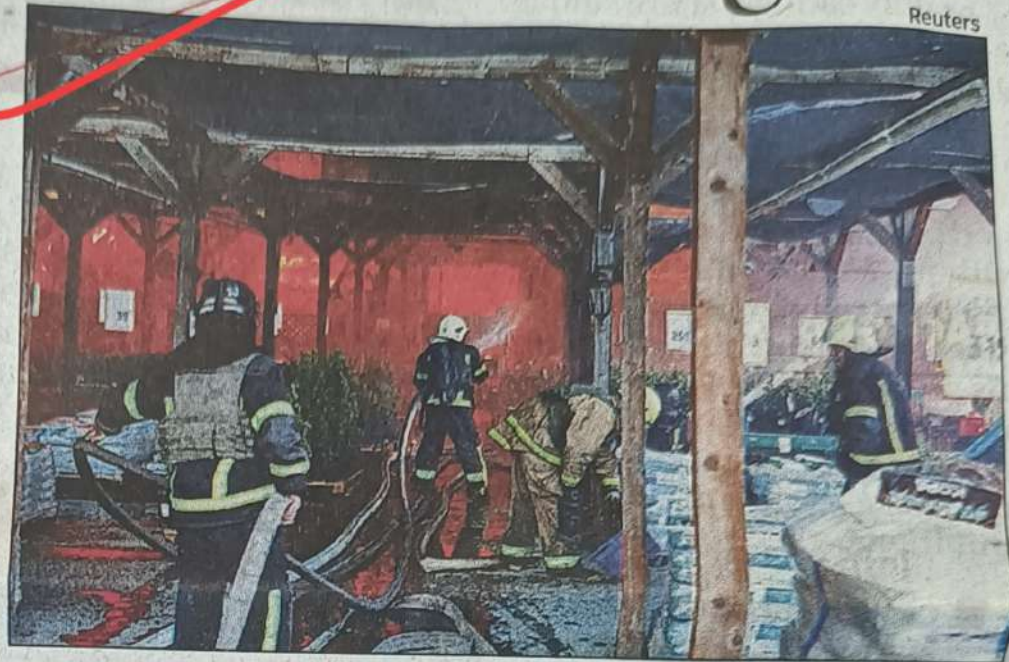
Firefighters battle a blaze at a shopping mall struck by Russian missiles in Kharkiv, Ukraine, on Saturday

Kharkiv is about 20km from the Russian border. Moscow's troops have in recent weeks captured villages in the area as part of a broad push, and analysts say they may be trying to get within artillery range of the city. Ukrainian authorities have evacuated more than 11,000 people from the region since the start of the offensive on May 10. "Our soldiers have now managed to take combat