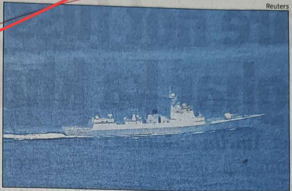
A Chinese warship is pictured while navigating at an undisclosed location in waters around Taiwan in this handout image, released by Taiwan defence ministry on Friday

"China's recent unilateral military provocations have not only undermined the status quo of peace and stability in the Taiwan Strait, but also openly provoked the interna-