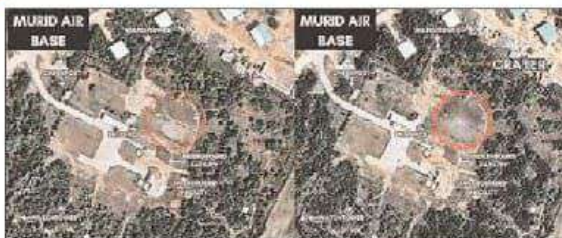
April 16 high-resolution satellite image shows (L) undamaged building at Murid air base. (R) Post-strikes image shows structural damages.

The high-resolution satellite images shared by the Intel Lab on X, shows a three-metre wide crater, just 30 metres from one of the two entrances at the strategic air base. The damages to buildings and rooftops of structures at the Murid air base, a hub of Pakistani drone and missiles, have already been