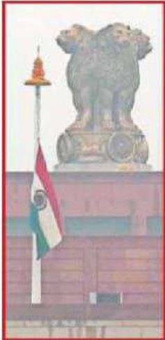
National flag flies at half-mast at the Parliament House during the seven-day State mourning following the demise of former Prime Minister Manmohan Singh in New Delhi.

Meanwhile, Congress President Mallikarjun Kharge wrote to Prime Minister Modi, urging him to conduct the last rites of Singh at a place where a memorial can be built.