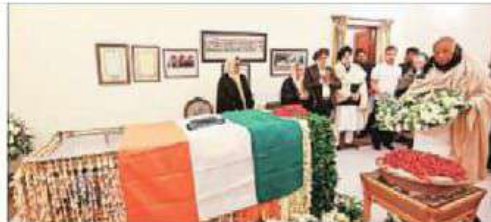
(Top) Prime Minister Narendra Modi lays a wreath to pay his last respects to the mortal remains of former Prime Minister Dr Manmohan Singh at his residence in New Delhi on Friday. Union Home Minister Amit Shah and others are also present. (Above) Congress President Mallikarjun Kharge pays his last respects to Manmohan Singh. Party MP and LoP Lok Sabha Rahul Gandhi and Party Chairperson Sonia Gandhi are also seen.

He is survived by his wife and three daughters. The Union Cabinet at its meeting held under PM Modi also condoled Singh's passing and hailed him as an eminent statesman and a distinguished leader who left an imprint on national life.