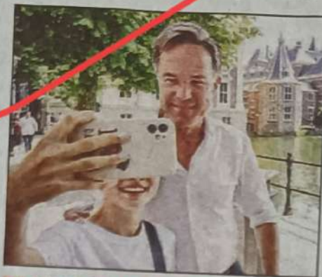
TOUGH ROAD AHEAD

Now serving as a caretaker PM before a new Dutch go-