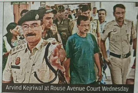
Arvind Kejriwal at Rouse Avenue Court Wednesday

▶ AAP netas say CBI has been caught lying after court agrees with Kejriwal's statement that he never tried to implicate Sisodia