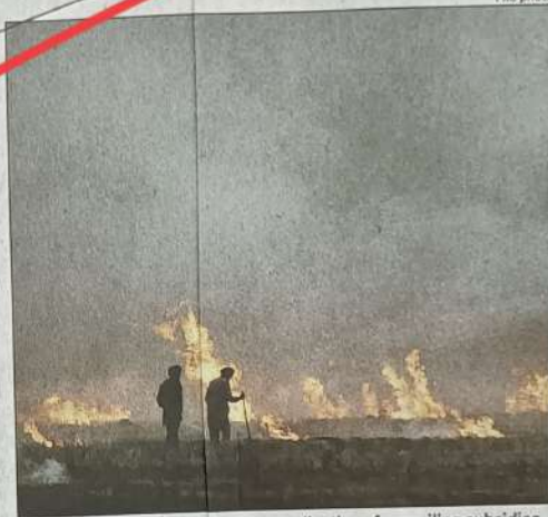
State govt has received 21,511 applications for availing subsidies

mum according to the guidelines of the scheme, he added. Under the scheme, the minister said, super SMS, su-