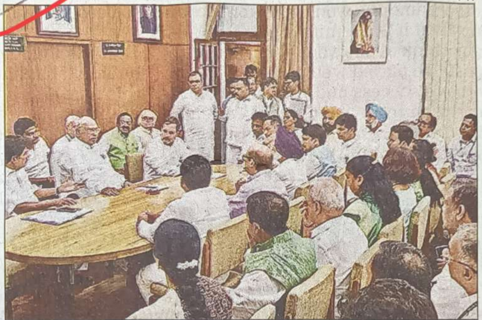
Congress chief Mallikarjun Kharge and MP Rahul Gandhi during a meeting with other leading lights of INDIA bloc on Wednesday

After his election, Birla told members that there should be a new vision and resolve for the 18th Lok