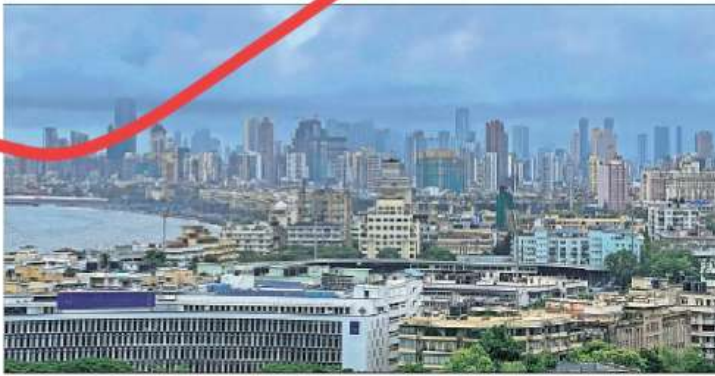
Monsoon clouds seen above the city skyline in Mumbai on Wednesday.

The flood-hit districts witnessed light to moderate rainfall, leading to a fall in the water level of all major rivers flowing below the danger mark, except the Kushiara river in Karimganj, according to the Assam State Disaster Management Authority (ASDMA). Nearly 1.50 lakh people were reeling under the deluge in Barpeta, Cachar, Darrang,