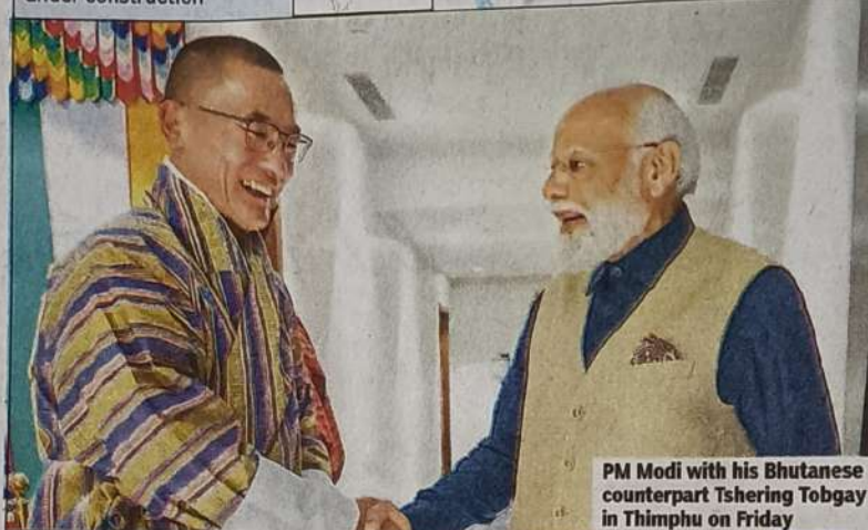
PM Modi with his Bhutanese counterpart Tshering Tobgay in Thimphu on Friday

of what might come next as the Chinese have already said they want to augment the demarcation with the establishment of diplomatic ties and expansion of economic cooperation.