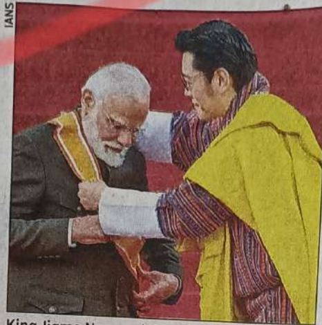
King Jigme Namgyel Wangchuck confers the Order of the Druk Gyalpo, Bhutan's highest civilian award, on PM Narendra Modi Friday

Modi's third visit to Bhutan, which was delayed by a day due to poor weather conditions, came after elections were