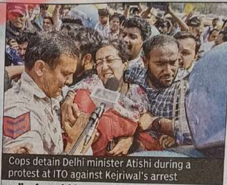
Cops detain Delhi minister Atishi during a protest at ITO against Kejriwal's arrest

▶ AAP ministers alleged they were prevented by