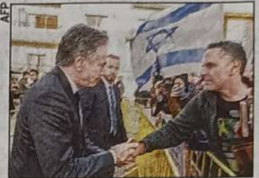
US secretary of state Antony Blinken (L) speaks with relatives of Israelis held hostage in Gaza as they rally in Tel Aviv on Friday

US and Israel has increasingly become public, with US President Joe Biden calling Israel's campaign in Gaza "over the top" and saying it has had too great a toll on civilian lives. The war was triggered by a raid into Israel by Hamas fighters who killed 1,200 and took 253 hostages, by Israeli tallies. More than 32,000 Palestinians have been killed in the subsequent Israeli bombardments, Gaza health authorities say.