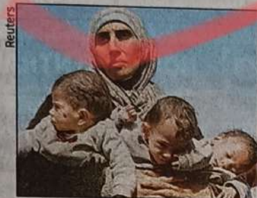
A woman flees al-Shifa hospital in Gaza along with her triplets. Israel said Friday that it had killed over 150 militants in its raid since Monday and had arrested hundreds of others

Russia's ambassador to the UN, Vasily Nebenzya, had denounced the US-backed measure before the vote, calling it "hypocritical". The draft, he said, was written with US poli-