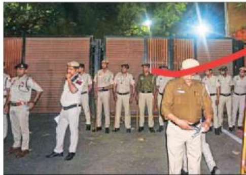
Security personnel deployed outside the residence of Delhi Chief Minister Arvind Kejriwal, in New Delhi on Thursday.