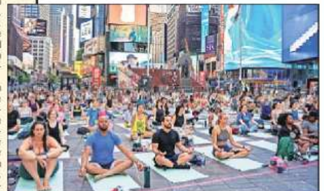
People perform yoga during a programme organised to celebrate the 10th International Day of Yoga at Times Square in New York, USA on Thursday.

Several other yoga teachers and experts led various meditation, exercises and breathing sessions throughout the day at Times Square, as thousands participated in the day-long activities. (Contd on page 5)