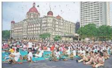
Police personnel and people perform yoga at Gateway of India on 10th International Day of Yoga in Mumbai on Friday.