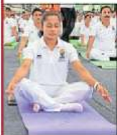
Prime Minister Narendra Modi, President Droupadi Murmu and gymnast Dipa Karmakar participate in the International Day of Yoga celebrations on Friday.