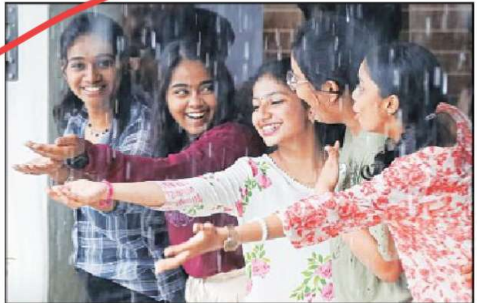
Girls enjoy monsoon rains, in Kozhikode, on Thursday.

The IMD said conditions were favourable for further advance of Southwest Monsoon into some more parts of Gujarat,