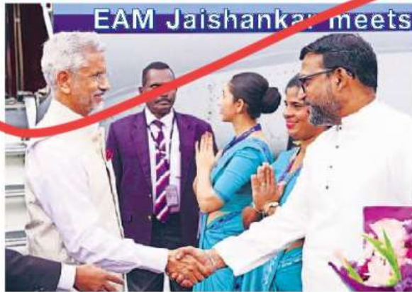
External Affairs Minister S. Jaishankar being welcomed by State Minister of Foreign Affairs of Sri Lanka Tharaka Balasuriya upon his arrival in Colombo, Sri Lanka, on Thursday.

Jaishankar, who met Wickremesinghe at the President's House, said that he