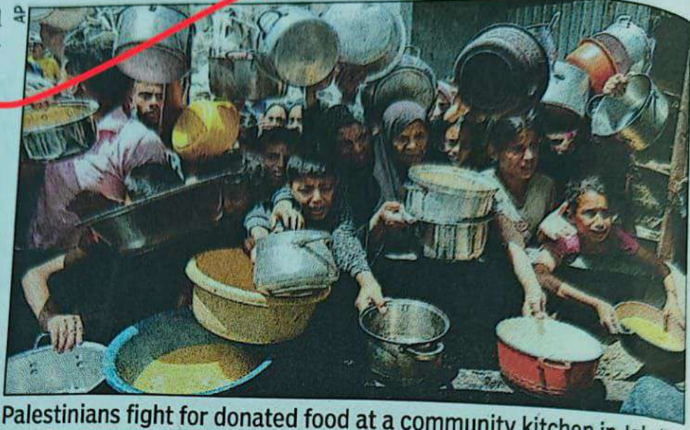
Palestinians fight for donated food at a community kitchen in Jabalia

Israel over the weekend launched a new wave of air and ground operations across Gaza, and the army ordered the evacuation of its second-largest city, Khan Younis, where