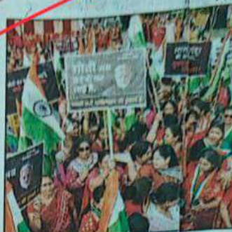
BJP workers join a Tiranga Yatra in Moradabad on Monday to celebrate the Indian armed forces for Operation Sindoor

On a question about China's military aid to Pakistan during the conflict, the official said that the query should be directed to competent authorities in the country. Mao gave a similar answer when asked if replenishment of the Chinese weapons system would be discussed during Dar's visit. The Chinese air force has denied reports that it is sending weapon supplies to Pakistan in a cargo plane.