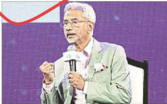
External Affairs Minister S Jaishankar speak at the ET World Leaders Forum, in New Delhi on Saturday.

Jaishankar said that if people are complaining of trade deficit with China and "we are too", it is because decades ago, "we consciously overlooked the nature of Chinese production