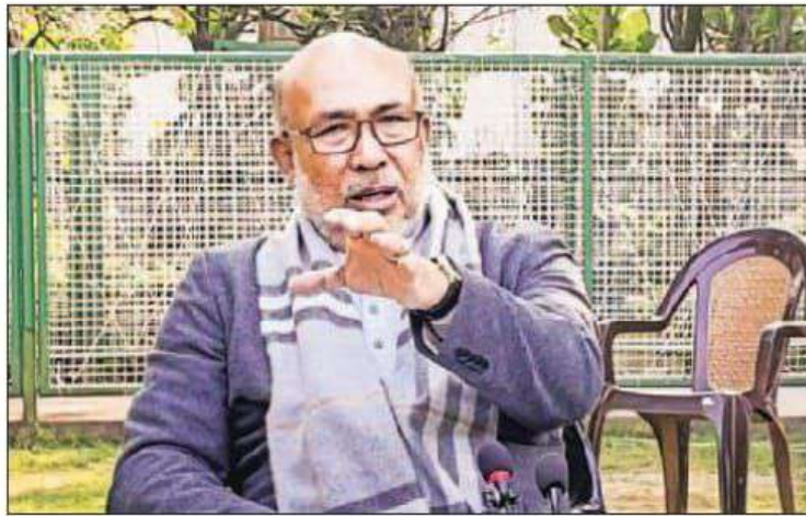
Manipur Chief Minister N Biren Singh addresses a press conference on Tuesday.

"From May to October, 2023, 408 firing incidents were reported. From November 2023 to April 2024, there were 345 firing incidents, whereas from May this year till now, 112 firing incidents were reported," he said.