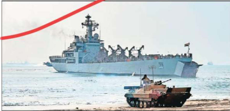
A Naval ship and armoured tank during closing ceremony of the Bilateral Tri-Service Humanitarian Assistance and Disaster Relief (HADR) Amphibious Exercise between India and US, Tiger Triumph 2024.

The closing ceremony of the amphibious exercise was held on board USS Somerset on