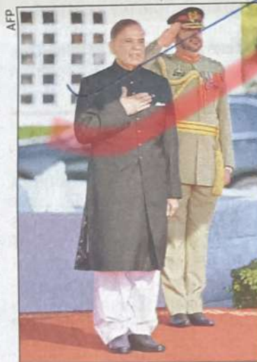
NO RED CARPETS: Shehbaz has banned the use of red carpets at govt events, reserving them for diplomatic receptions, as part of austerity measures to cut down costs in the cash-strapped nation

Sharif was responding to Biden's letter on Friday in which the latter, departing from his earlier stance of not engaging with Pakistani leaders, had assured him of Washington's support to Islamabad to tackle "the most pressing global and regional challenges". Biden's letter suggested that despite allegations of election fraud, the US govt is ready to work with Pakistan's new govt. In the letter, Biden did not congratulate