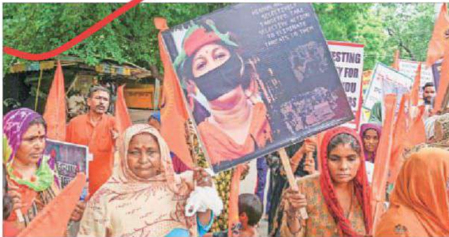
Members of Hindu organisations protest over the violence against minorities in Bangladesh at Jantar Mantar in New Delhi on Sunday.

The educational institutions in Bangladesh were closed indefinitely on July 17 to ensure the safety of students in the wake of clashes that erupted during the recent movement demanding reform of the job quota system. The Ministry of Education on Thursday issued a directive to reopen the institutions under its jurisdiction. All the educational institutions reopened on Sunday, after a month of closure.