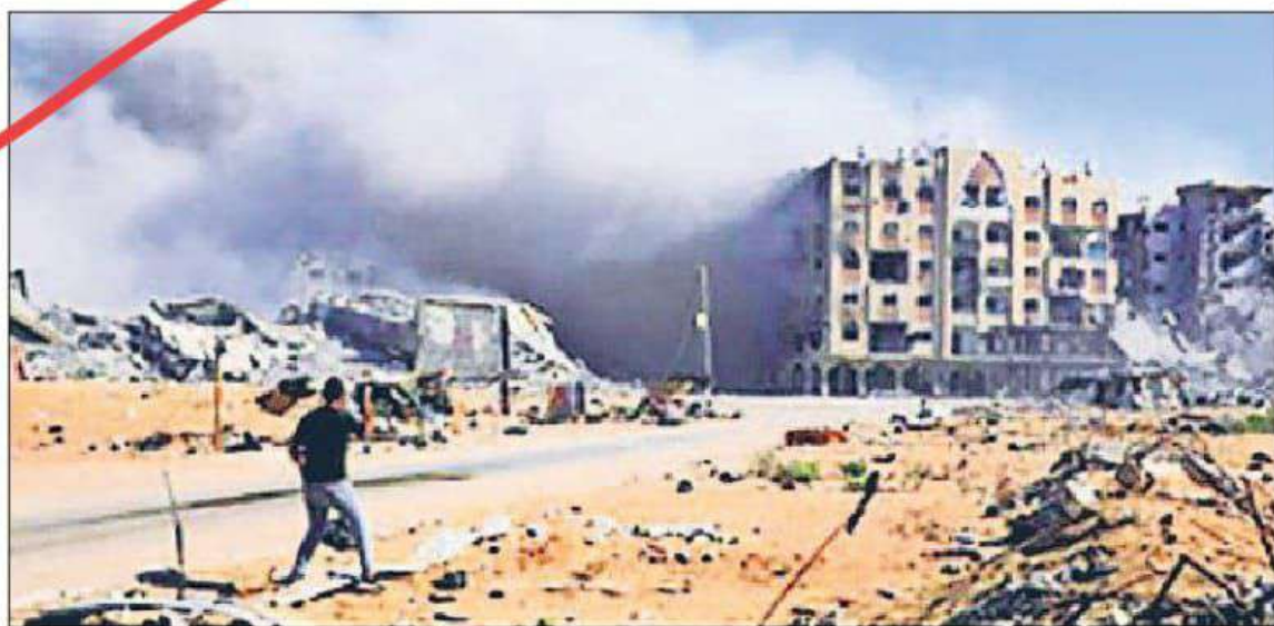
A man runs after Israeli airstrike hits Gaza.

Negotiations between Israel and Hamas have yet to achieve progress in Qatar's capital, Doha. Hamas, which released an Israeli-American hostage as a goodwill gesture before Trump's trip,