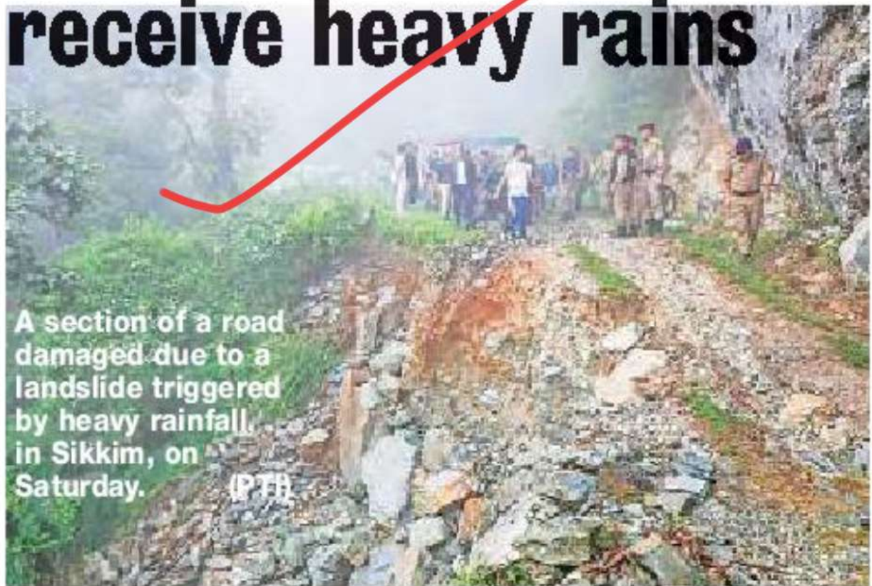
A section of a road damaged due to a landslide triggered by heavy rainfall in Sikkim, on Saturday.