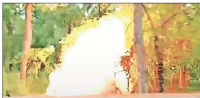
(Left) A security personnel injured during an encounter with Naxalites being treated in Narayanpur district on Saturday. (Above) Pipe bombs and pressure cooker bombs have been deactivated by soldiers in Bijapur on Saturday.