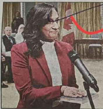
Anita Anand takes oath at Rideau Hall in Ottawa on Tuesday

Anand, 57, a seasoned politician and legal scholar, was appointed as minister of foreign affairs. A prominent Liberal voice, she previously served in key roles under both