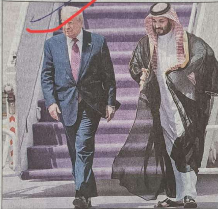
Trump is greeted by Mohammed bin Salman in Riyadh on Tuesday

Syrian foreign minister Asaad al-Shibani, in a statement to Reuters, said it marked a turning point for the Syrian people in their efforts to rebuild. Sharaa was for years