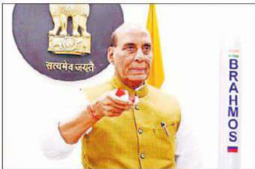
(L) Defence Minister Rajnath Singh virtually attends the inauguration of BrahMos Aerospace Integration and Testing Facility, in New Delhi on Sunday. (R) Uttar Pradesh Chief Minister Yogi Adityanath with Deputy Chief Ministers Keshav Prasad Maurya and Brajesh Pathak during the inauguration of BrahMos Aerospace Integration and Testing Facility, in Lucknow on Sunday .