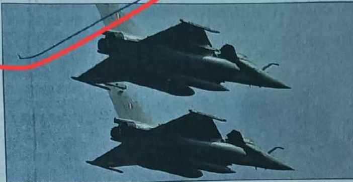
The missile fired at Rahim Yar Khan airbase caused a massive crater on a portion of the runway, the district deputy commissioner said

Sources acknowledged that the attack in the dead of night had been timed to avoid civilian casualties. Although passenger flights to and from the airport have since resumed, the missile strike has severely limited military op-