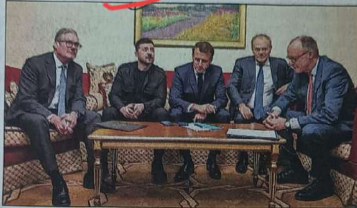
British PM Starmer, French President Macron, Polish PM Tusk and German Chancellor Merz huddle with President Zelensky in Kyiv on Saturday

Putin's proposal had come hours after major European powers demanded on Saturday in Kyiv that Putin agree to an unconditional 30-day ceasefire or face "massive" new sanctions, a position that Trump's Ukraine envoy Keith Kellogg endorsed on Sunday. Zelensky too had said Ukraine would be ready for talks with