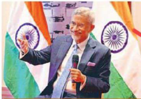
EAM S Jaishankar during an interaction with members of Indian community in Belgium and Luxembourg.