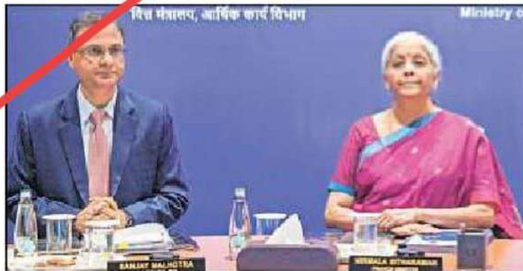
Union Finance Minister Nirmala Sitharaman with RBI Governor Sanjay Malhotra during the 29th meeting of the Financial Stability and Development Council (FSDC), at RBI headquarters.

"Also present during the #FSDC meeting are Governor @RBI; Finance Secretary and Secretary, D/o Economic Affairs; Secretaries of @DFS_India; D/o Revenue; OSD DEA @FinMinIndia; and @MCA21India; Chief Economic Adviser; Chairpersons @SEBI_India, @IFSCA_Official, senior representatives from @PFRDAofficial, @IBBIlive,