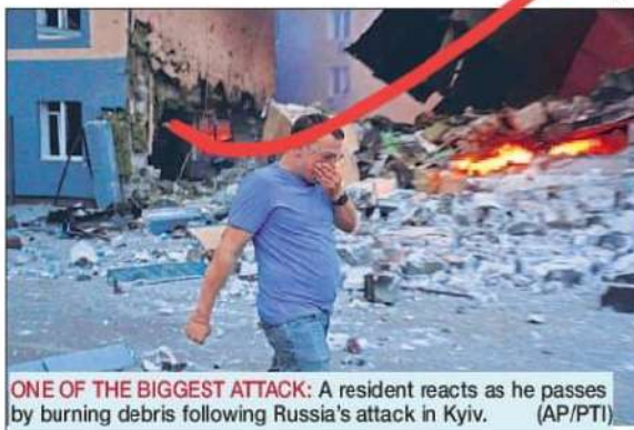
ONE OF THE BIGGEST ATTACK: A resident reacts as he passes by burning debris following Russia's attack in Kyiv.

"Russian missile and Shahed strikes are louder than the efforts of the United States and others around the world to force Russia into peace," Zelenskyy wrote,